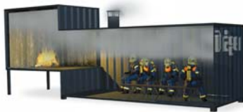
Wood-fired training gallery