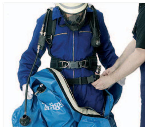
If your suit is equipped with a ventilation systems or a guidance line adapter...