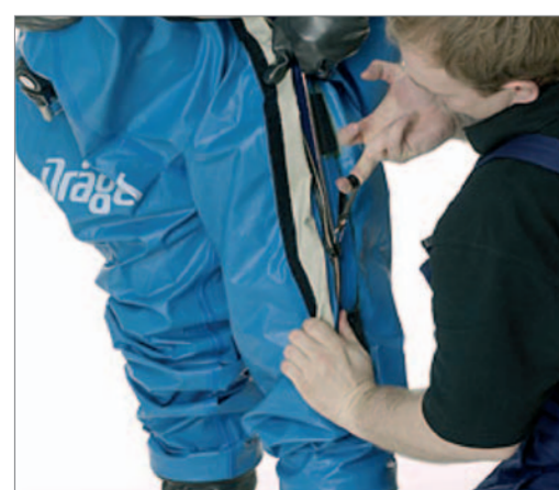
Pull the pull strap only with the middle finger, so that you do not apply to much force.