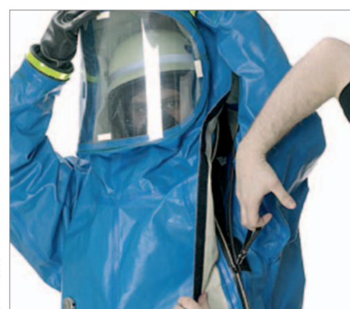
By lifting the hood you can pull the blades parallel.