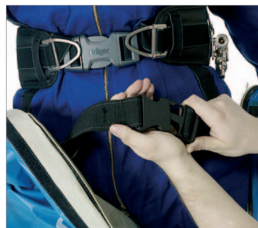
... close and tighten the integrated hip belt at the closing clasp.