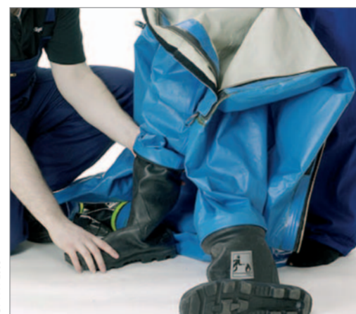
Put your right foot into the right boot.