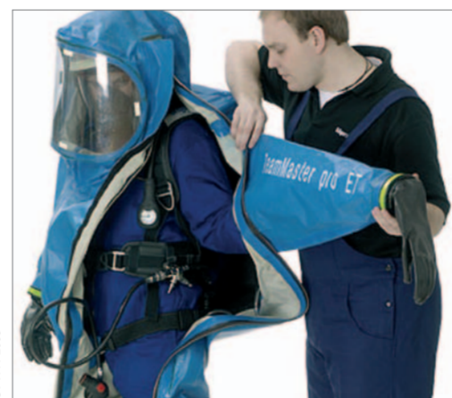
Put your left hand into the left sleeve and glove.