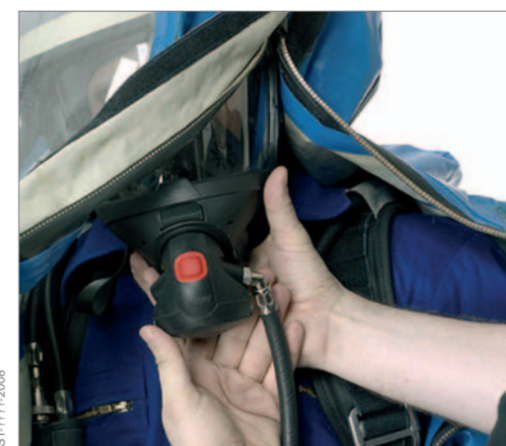
Before closing the zipper connect the lung demand valve.