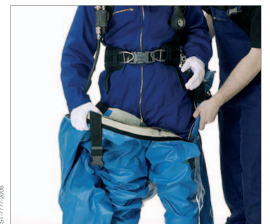
Lift the suit up to the hip.