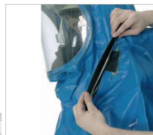
Close the cover flap with the velcro.