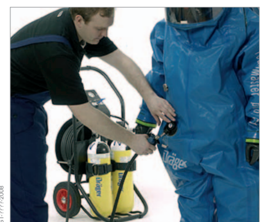
Connect the Regulation Valve PT 120 L to an external air source when necessary.