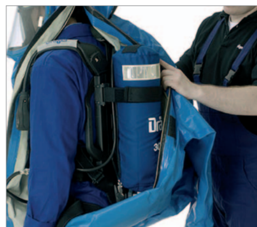
Cover the breathing apparatus with the backpack.