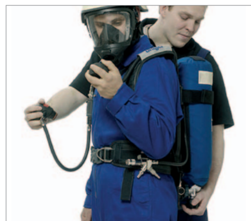
Before donning open the valve of the cylinder and do the necessary functional tests.