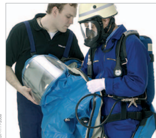
Put the right arm into the right sleeve.