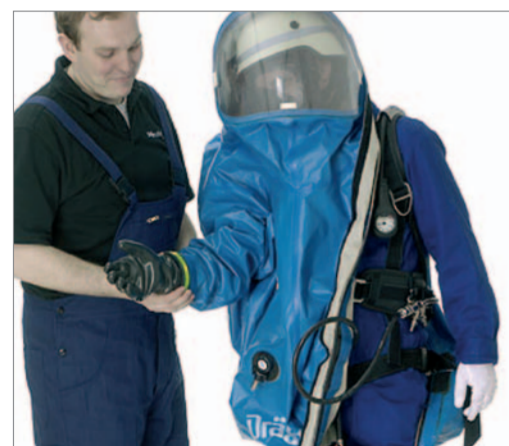
Put your hand into the glove.