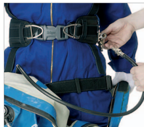
Connect the middle pressure hose inside the suit to the belt manifold of the automatic switch-over valve (ASV).