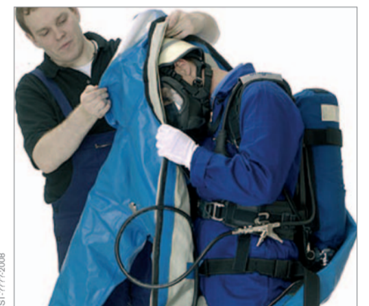
Thereby put your head into the hood.