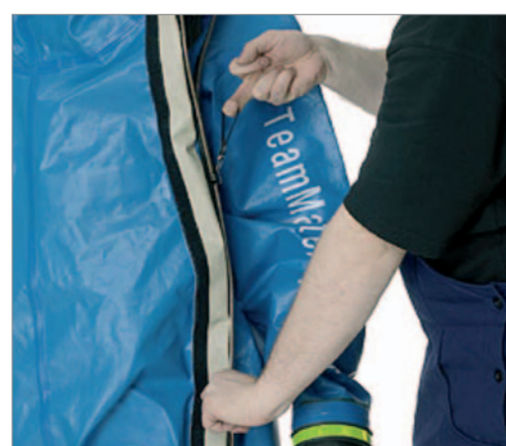
If the closer system gets stuck, pull it a little bit backwards and try it again – ensure good lubrication.