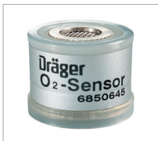
O 2 sensor capsule