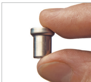
Fast O 2 sensor